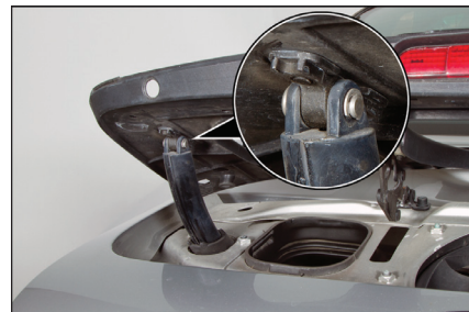
Diagnosis and repair information for the power rear spoiler. 55 Trunk Lid, Engine Hood